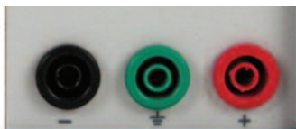
The 9120 series uses 4mm sheathed banana jacks that accept sheathed or shrouded banana plugs and meet the latest international safety standards.

Supplied: User manual, line cord, RS232 communication cable, Software Installation disk. Model 9123A also includes GPIB to TTL Serial Converter cable IT-E135 Optional: IT-E132 USB to TTL Serial Converter cable , IT-E151 rack mount kit.